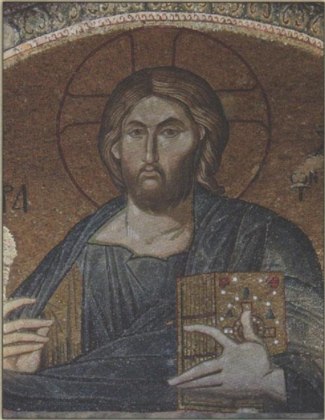
Icon of Christ Pantocrator