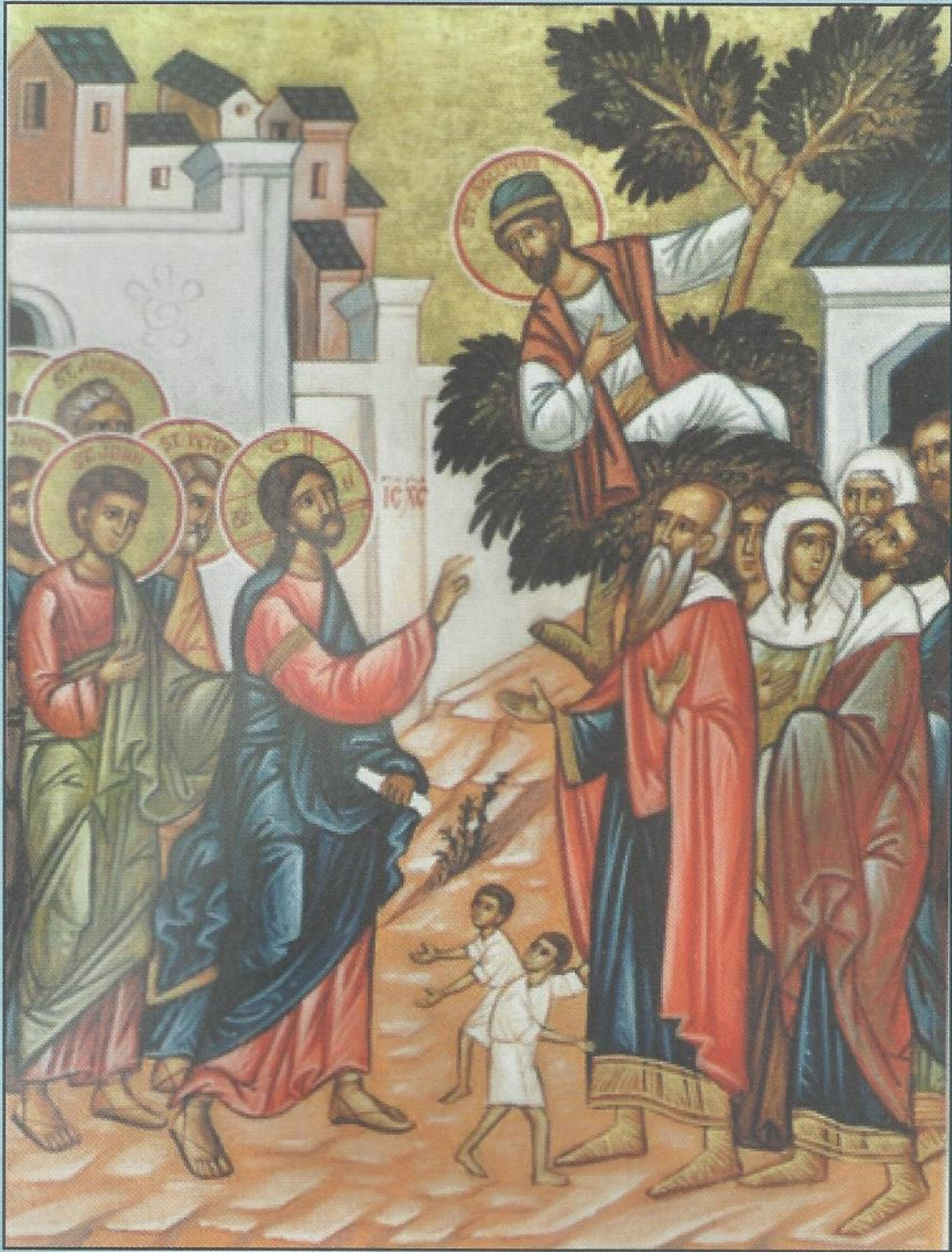
Icon of the Encounter of Jesus with Zacchaeus